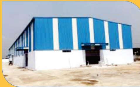
VARIOUS PURPOSE PEB.