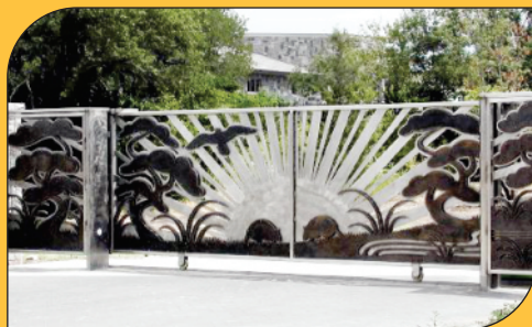
AUTOMATIC DESIGNER GATES