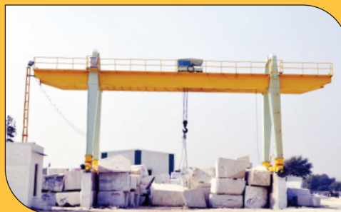
EOT & GANTRY