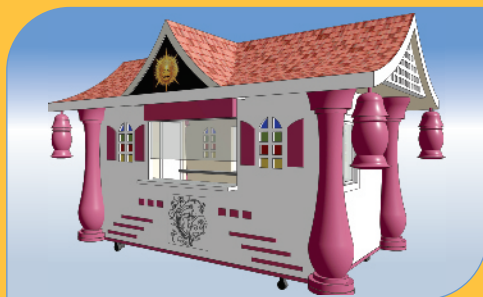
KIOSK / MOBILE RESTAURANT