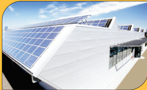
PEB. WITH SOLAR PANELS